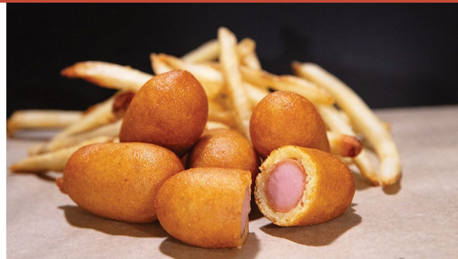
@Prints2go • 727-725-1700 • www Prints2go us

INCLUDES A SIDE (FRIES OR APPLESAUCE) AND KIDS DRINK (MILK, SODA OR JUICE). MAC AND CHEESE GRILLED CHEESE CHEESE BURGER CORN DOG CHICKEN STRIPS GRILLED OR FRESH-BREADED